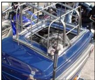
The 2nd part of a pair, anxiously awaiting the start of the ride!!

"This created not only a memorable event but one that presented Sammie's Friends with almost $7,500"