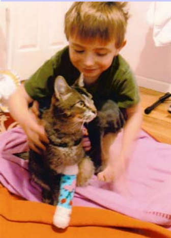
Duke and Family Member