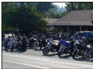
Some of the bikers preparing to start the ride....

"This created not only a memorable event but one that presented Sammie's Friends with almost $7,500"