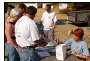
Riders selecting their first poker card

This ride proved, once again, the generosity of the biker community in helping those that cannot help themselves. Motorcyclists have long been known to fully support charitable causes and always come through when help is needed. Many thanks to all those who rode in the poker run, bought raffle tickets and supported this event. Also a great deal of appreciation to the volunteers that helped with this event. We could not have done it without you!