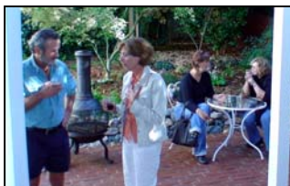
Guests enjoying the wonderful weather and surroundings..