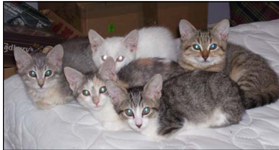
Cute as bugs in a rug, our last litter of fosters poses for a picture.

and end up keeping the animals. Ours is a kitten fostering household and we fall into this category. In many of the litters we foster, it seems that there is one kitten who just ends up staying with us. This fact is born out in that in the 18 months we've been fostering, we've gone from a 2 cat household to a 6 cat home. We weren't looking for these additions, they instead seemingly found us, and consequently are all the more meaningful to us.