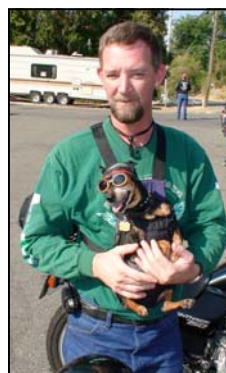
Dressed & ready to roll!!

the riders chose to sit out on one of two huge porches that lined the Horsemen's Club. Others just wanted to lie on the green grass under the shade trees and trade motorcycle stories. Raffle prizes included tool kits, hotel stays, Harley shirts, gift certificates, a new propane BBQ and too many more to mention. Autographed sports memorabilia was won at the silent auction with prizes going to the highest bidders. The band played "Stuck in Lodi again" as the winner with the high hand, who rode all the way from Lodi, collected his $100 poker run prize.