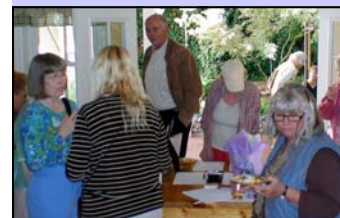
Partaking of the wonderful food and company...