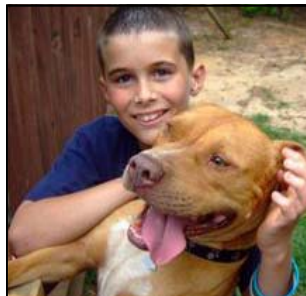
Buddy and a Georgia friend.....

with people, and Rosie. Currently, I get to play with Rosie every day. When we play, she jumps all over me, but that's OK, because I'm a gentleman (and she's the boss)!!