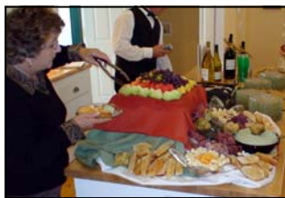
Some of the wonderful eats available to attendees....

Attendees enjoyed wonderful food, great wine and lovely music. By days end, through ticket sales,