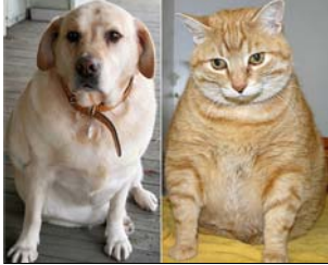
Two examples of what can happen when pets are over fed and under exercised ....

"Diabetes, arthritis, poor skin, trouble breathing, cardiovascular disease and surgical complications are all increased risks with obesity"