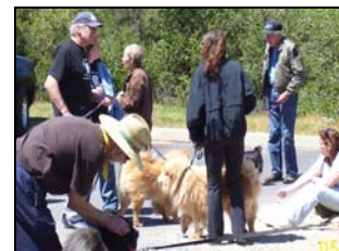
Volunteers, attendees, and canine companions mingle at the Adoptathon.