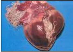
A dog's heart infected with heartworm.

"One reason heartworms are so common in our area is the very high incidence of infection in our resident coyote population"