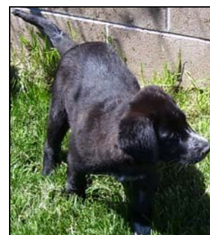
A Labrador pup who had been residing at the NCAS. This little gal, as well as her sister, found new forever homes at the Adoptathon.

YES, I want to help make a difference in the lives of the unwanted animals of Nevada County! Sammie's Friends is a volunteer organization created to raise veterinary funds for the animals at the Nevada County Animal Shelter. Our work with the animals is made possible by the donations of generous individuals in our community. All donations are greatly appreciated, and all monies raised are for the benefit of the animals. Checks may be submitted to the address below, or visit our website at www.sammiesfriends.org and click on the Paypal link for credit or debit cards donations.