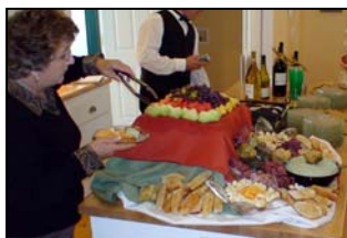
Some of the wonderful eats available to attendees....

Attendees enjoyed wonderful food, great wine and lovely music. By day's end, through ticket sales,