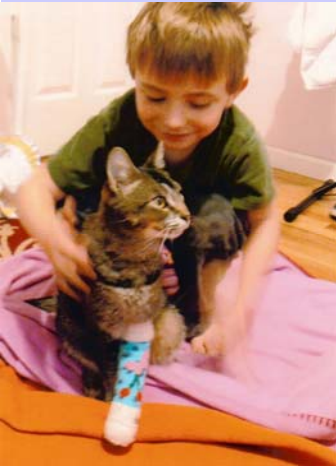
Duke and Family Member