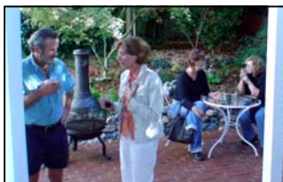
Guests enjoying the wonderful weather and surroundings..