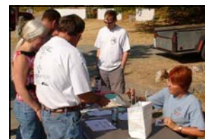
Riders selecting their first poker card

This ride proved, once again, the generosity of the biker community in helping those that cannot help themselves. Motorcyclists have long been known to fully support charitable causes and always come through when help is needed. Many thanks to all those who rode in the poker run, bought raffle tickets and supported this event. Also a great deal of appreciation to the volunteers that helped with this event. We could not have done it without you!