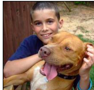
Buddy and a Georgia friend.....

with people, and Rosie. Currently, I get to play with Rosie every day. When we play, she jumps all over me, but that's OK, because I'm a gentleman (and she's the boss)!!