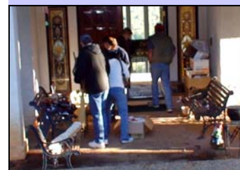
Early morning shoppers surveying the goods!!