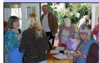
Partaking of the wonderful food and company...